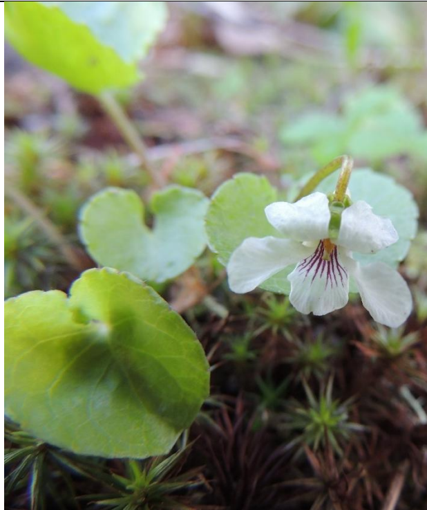
Kidney-leaved violet ( Viola renifolia )