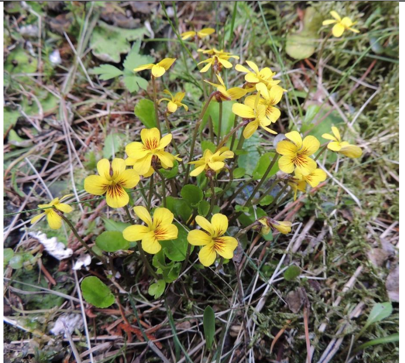
Round-leaved violet ( Viola orbiculata )