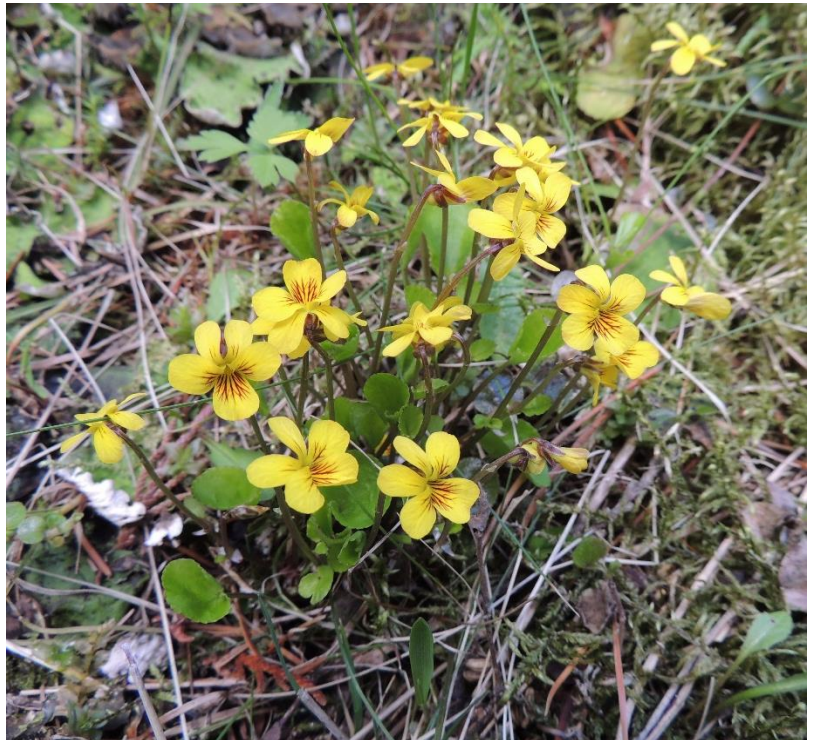
Round-leaved violet ( Viola orbiculata )