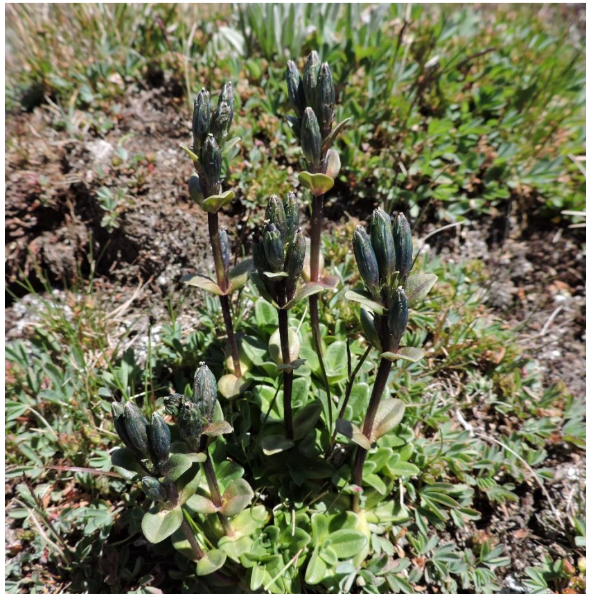
Glaucous gentian ( Gentiana glauca )