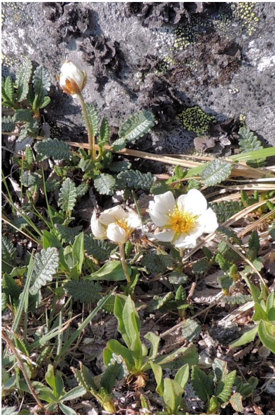
White mountain-avens ( Dryas octopetala )